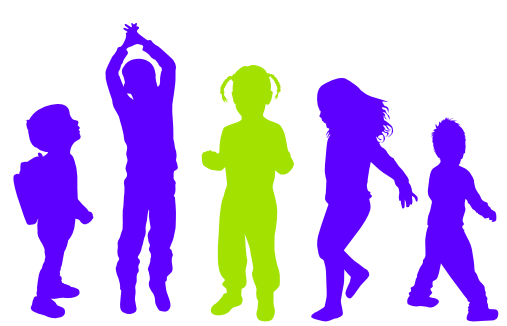
1 in 5 children need extra support for their learning